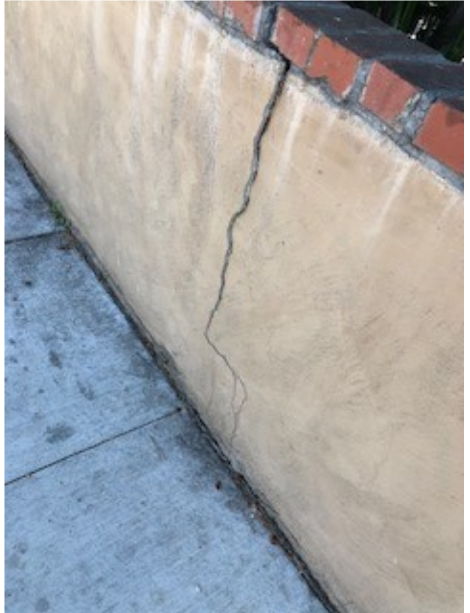
Wall opposite tree