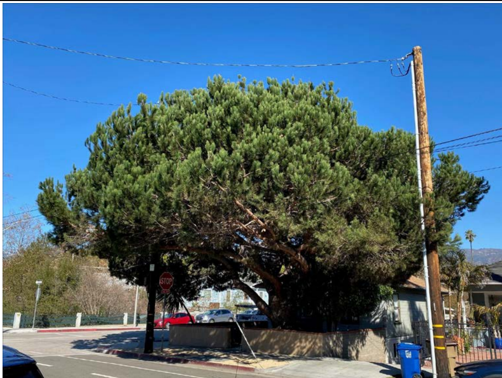
Front Yard 536 Bath St. – Rhonda Wheatley 2-23-22 Attachment 8