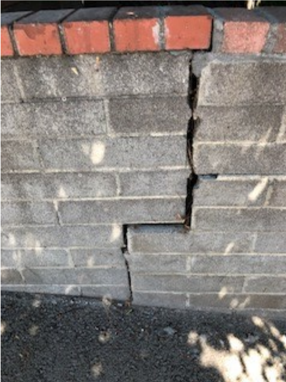
Wall next to tree