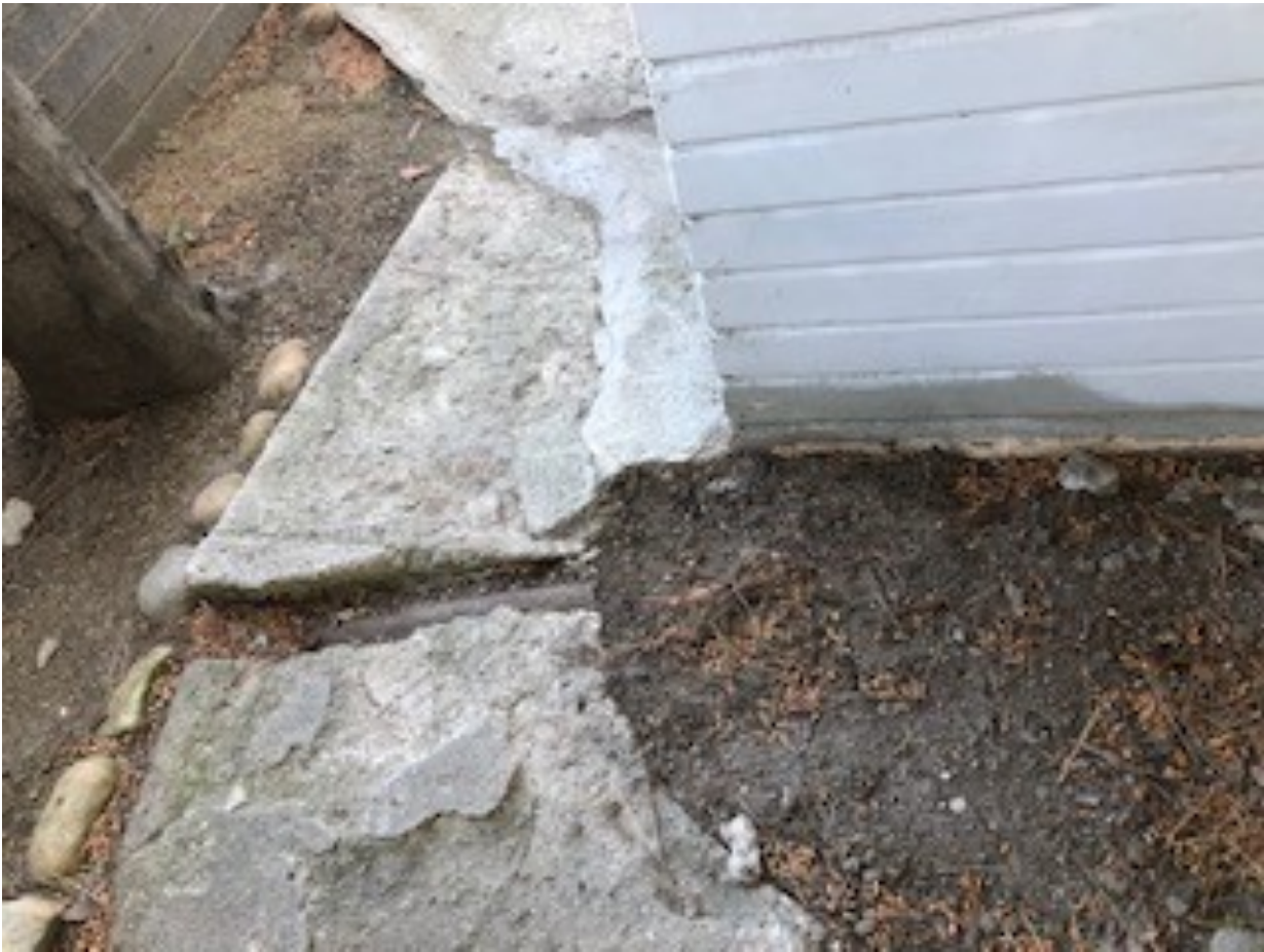
Crack in foundation